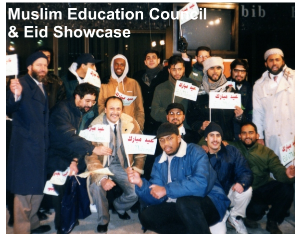
Muslim Education Council & Eid Showcase