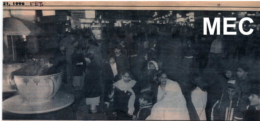
OPEN-AIR party ... crowds throng Wilmslow Road, Rusholme, where the traffic was stopped to allow the festival to take place in safety