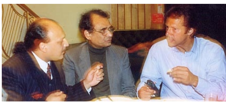
Prime Minister Shokate Aziz London, X Prime Minister Banezir Bhutto, Qassim AFZAL, & Imran Khan MNA ( Manchester) 1989 to 2005