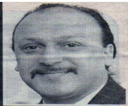
■ QASSIM AFZAL: International role