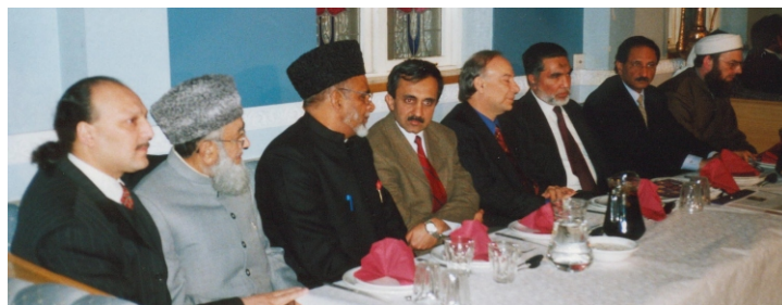
Address by Leading Politicians Scholars Ambassadors, senators & LibDems Cllr