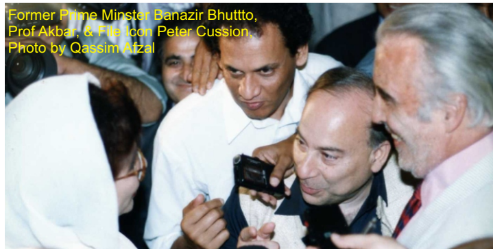
Former Prime Minister Benazir Bhutto, Prof Akbar, & Film Icon Peter Cussion.