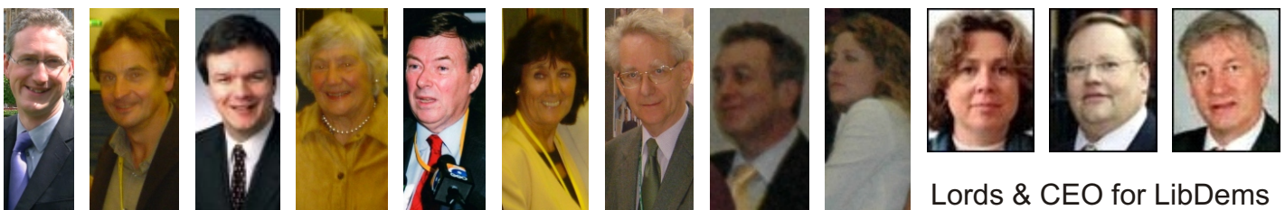
Lords & CEO for LibDems