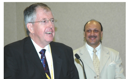
Lords Leader Tom McNally