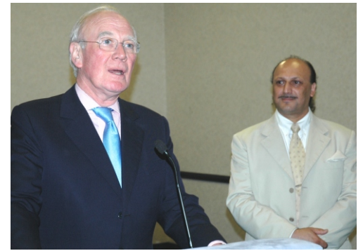
Leader Menzies Campbell QC MP