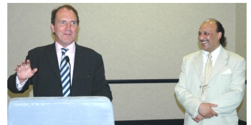
President Simon Hughes MP